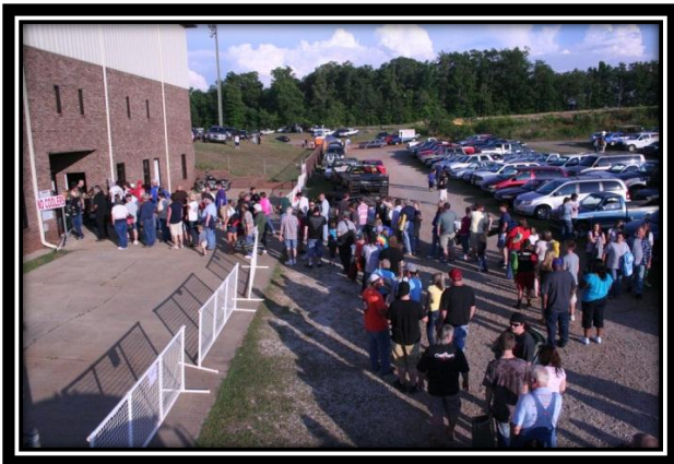
FANS ENTER THE GRANDSTANDS AT AMS