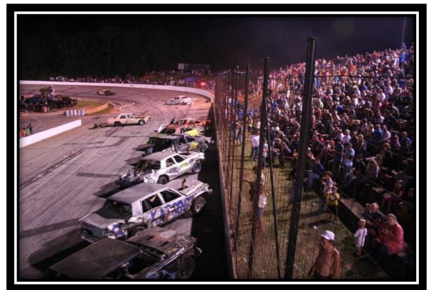
DEMO DERBY NIGHT AT THE RACES